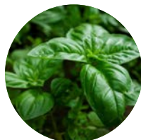
Basil (recommended for indoor walls only)