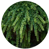
Lonicera 'May Green'