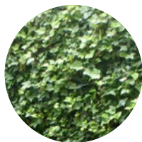
Hedra helix (the common ivy)