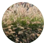
Pennistum (Chinese fountain grass)