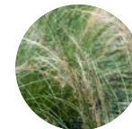
Tufted hair grass