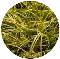
Slender sweet flag 'Ogon'