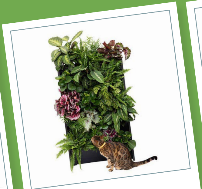
Set of 5