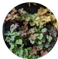
Heuchera (coral bells)