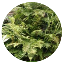
Dryopteris (wood fern)