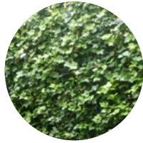
Hedra helix (the common ivy)