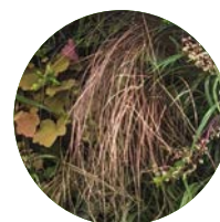
Carex 'Red Rooster'