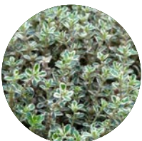
Thyme 'Silver Queen'