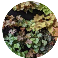
Heuchera (coral bells)