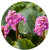
Bergenia (elephant's ears)