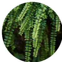
Lonicera 'May Green'