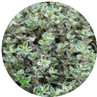
Thyme 'Silver Queen'