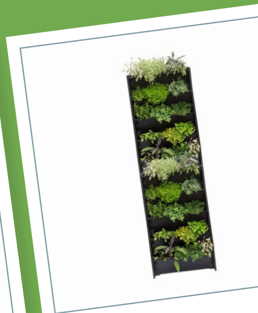
Set of 10