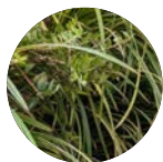
Carex 'Irish Green'