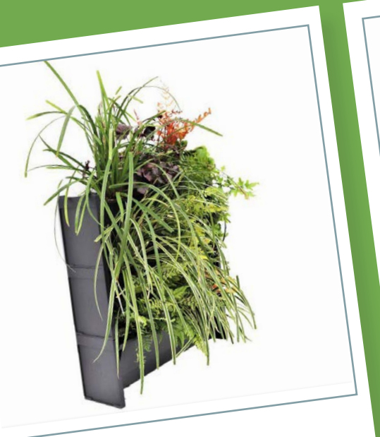
Set of 3

PlantBox is available from our website in sets of 3, 5 and 10