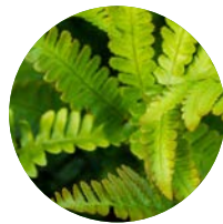
Polystichum (shield ferns)