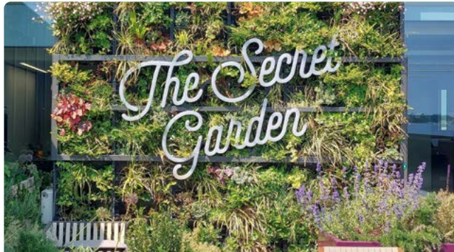
Roof Gardens and Terraces