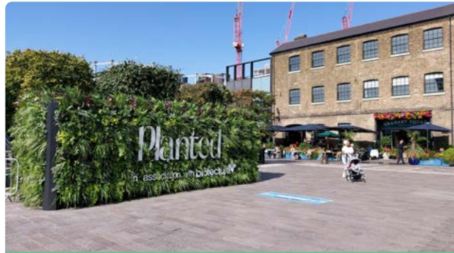
Events and Pop-ups